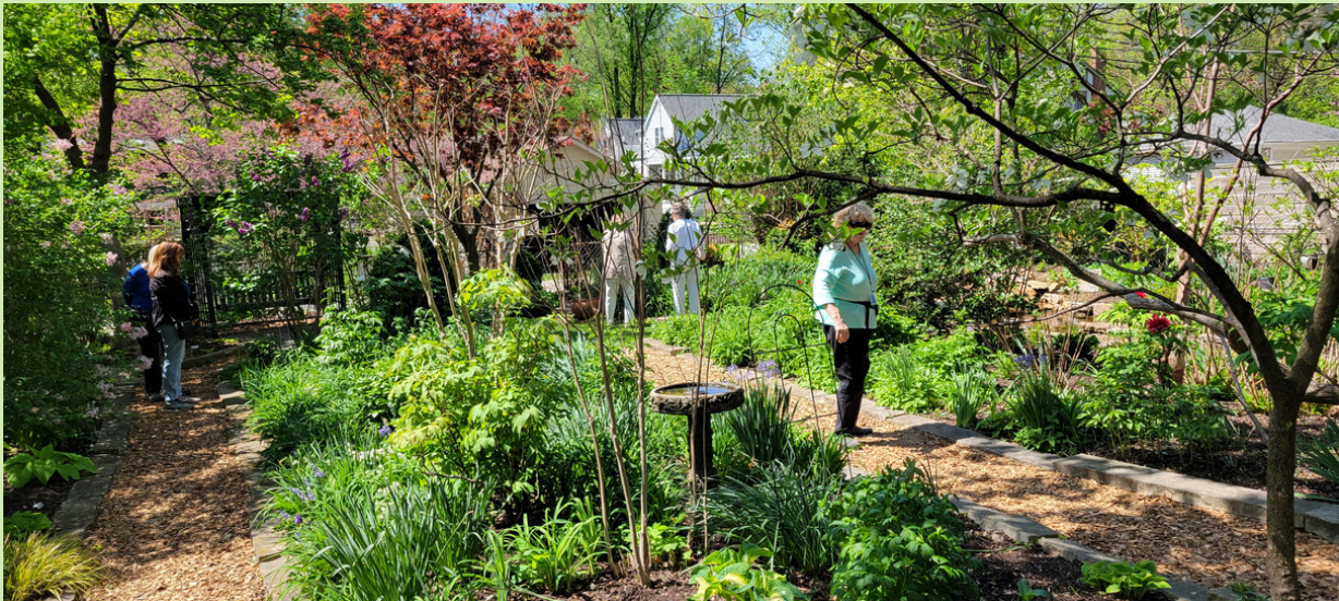
Photo above is from garden tour in St. Louis at state meeting

I hope to see you all on June 12. Start time is 8:30 at your first stop (I will let you know your 1st stop after the groups are formed.)